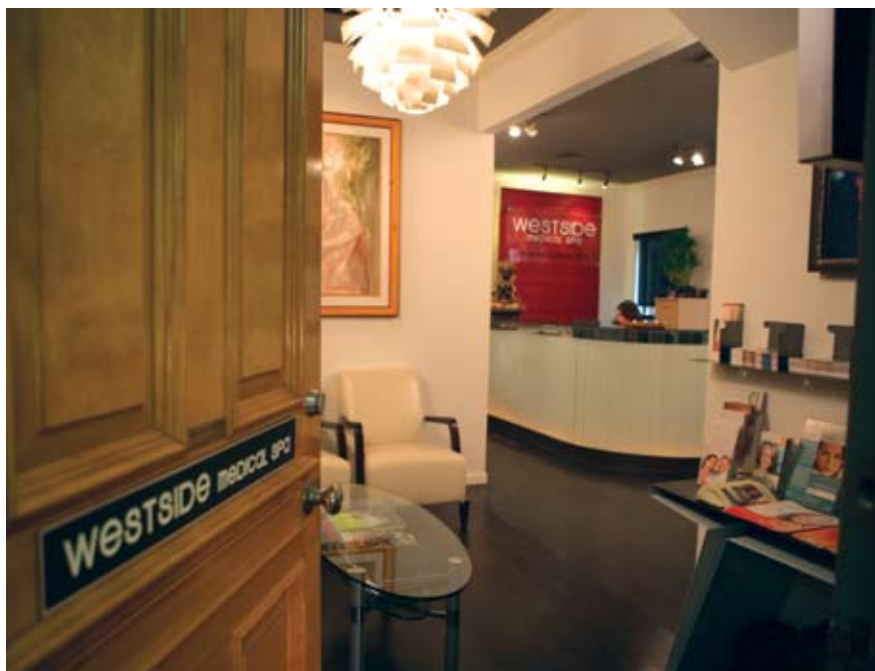
Westside Aesthetics features an open floor plan that allows patients to mingle with staff members.

Fillers that focus on longevity of results with low in-